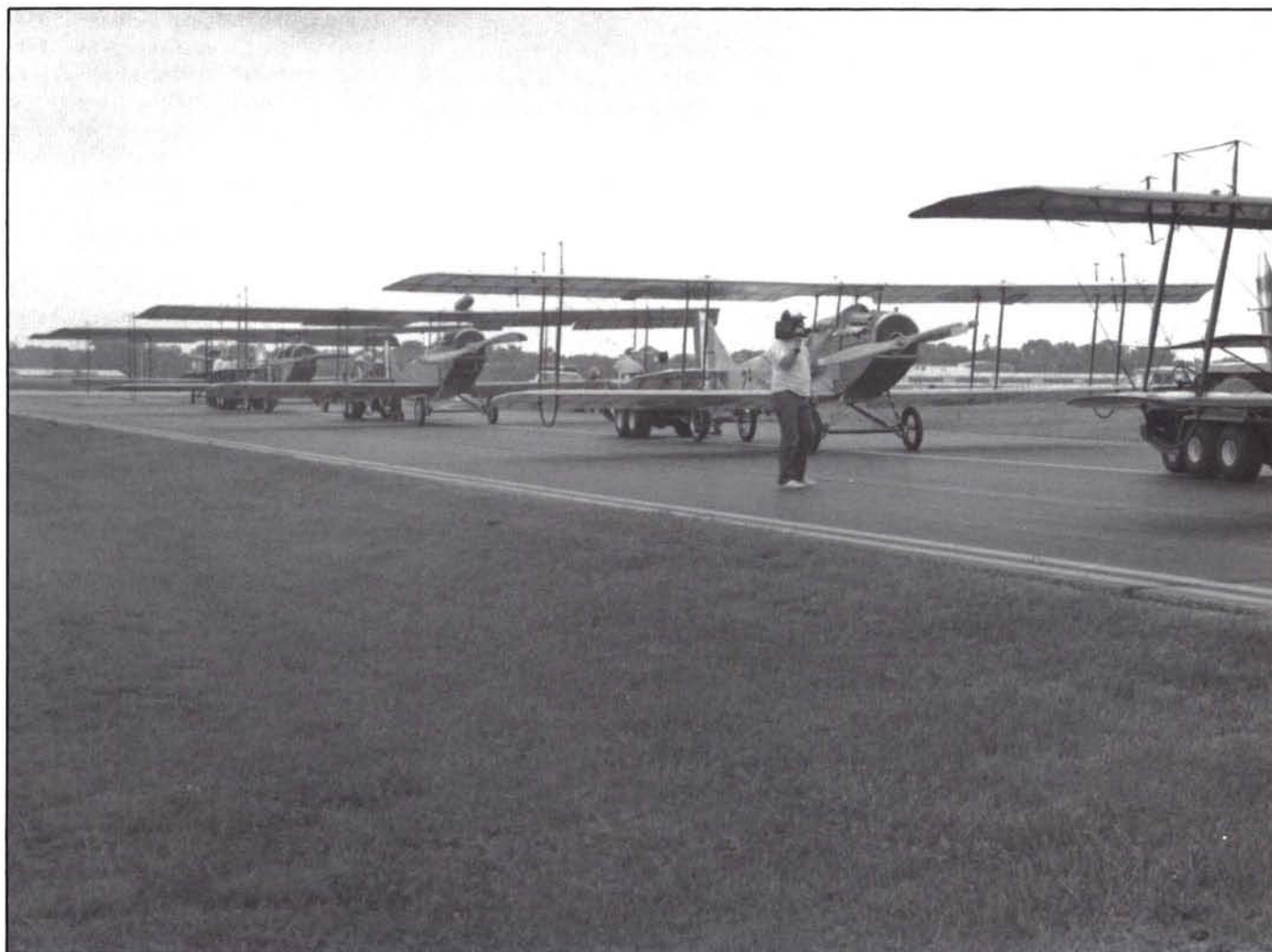
Jennies on the move, being towed from overnight shelter in hangars to the Antique flightline.