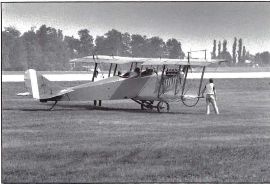
Wingwalkers are standard equipment with a Jenny.